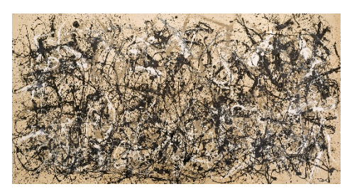
Figure 11. Jackson Pollock, Number 30, Oil on canvas 269.5x530.8 cm Modern Art Museums of New York. Gombrich, E. H., & Gombrich, E. H. (1995). The story of art (Vol. 12). London: Phaidon

"Easel, palette, brush, etc., I'm moving away from the usual painting tools and I'm tempted to work with sticks, drops, blades and dripping liquid paint or use sand with broken glass or other stuff to make a heavy impasto (dark colouring). I do not know what I am doing in the painting. But I see and realize what I did after an introduction 'period." (Harrison & Wood, 1992, p.610).