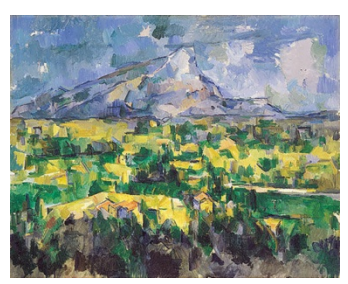
Figure 6. Paul Cezanne, Mont Sainte-Victorire From Les Lauves,Oil on canvas, 60x72cm Basel,Öffentliche Kunstmuseums.Basel. Gombrich, E. H., & Gombrich, E. H. (1995). The story of art (Vol. 12). London: Phaidon

Impressionism examines the projections of objects and their effects on one another at various moments of the day provides an understanding of painting based on subjective senses that photography cannot obtain.