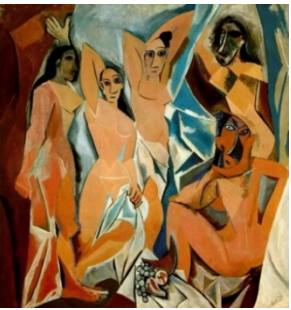
Figure 8. Pablo Picasso, The Girls of Avignon, oil on canvas,243.9x233.7 cm Museums Of Modern Art, New York. Lynton, N. (1980). The story of modern art.