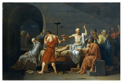
Figure 3. Jacgues-Louis David, The Dead Of Socrates, Oil on canvas, 129.5X196.2 cm, The Metropolitan Museums Of Art, New York, Galitz, K. C. (2016). The Metropolitan Museum of Art: Masterpiece Paintings. Metropolitan Museum of Art.